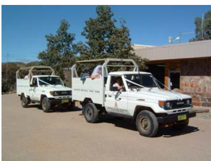
Recent wedding at Arkaroola

Please refer to our standard brochure (attached) for details of our tours and other activities and facilities.