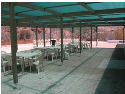
Ningana - external shaded areas