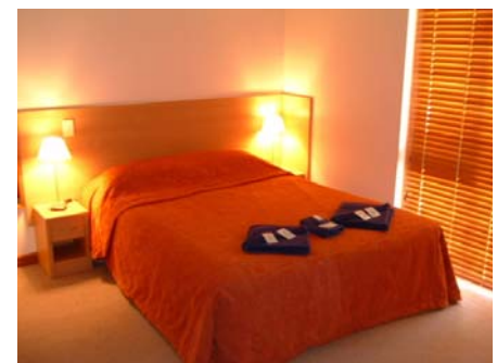
Mawson Lodge room