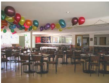
Ningana Conference Centre (Fully Licensed)