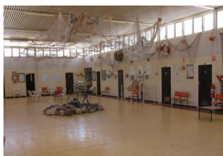
Greenwood Lodge Hall (Licensed area)

Why not consider Arkaroola for your next corporate convention, conference or wedding?