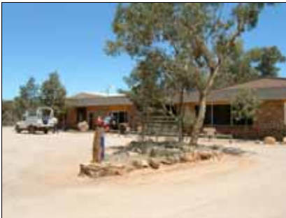
Reception, Shop & Restaurant

The spectacular Advanced Ecotourism accredited 4WD Ridgetop Tour is world famous - taking visitors on a journey through deep valleys and across the peaks of the Flinders Ranges most rugged mountains to the magnificent climax at Sillers Lookout .