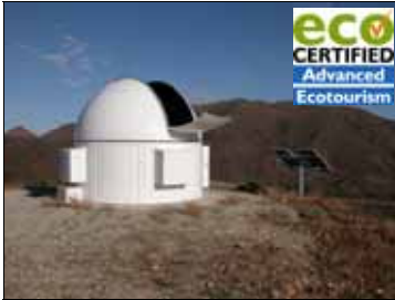
Arkaroola's Oliphant Observatory with wedges for BYO telescopes