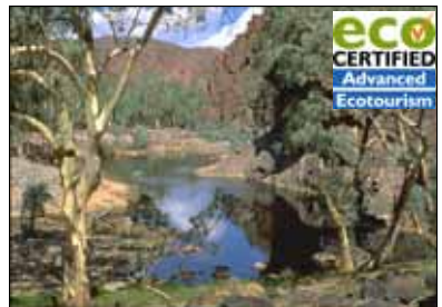
Tillite Gorge & Waterhole

A variety of Guided and Tag-along Waterhole Tours are available for you to enjoy native flora and fauna in the vicinity of tranquil waterholes, including: • Arkaroola Waterhole • Echo Camp • Bolla Bollana • Nooldoonooldoona • Tillite Gorge & Waterhole .