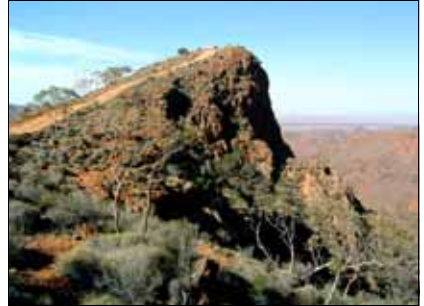
Sillers Lookout - Ridgetop Tour

Featuring rugged mountains, towering granite peaks, magnificent gorges and mysterious water-holes, Arkaroola is home to more than 160 species of birds and the shy yellow-footed rock wallaby. Arkaroola is a Mecca for bushwalkers and four-wheel drivers. A range of fully guided day and night bushwalking tours, as well as tag-along, fully guided or self-drive 4WD tours, are available.