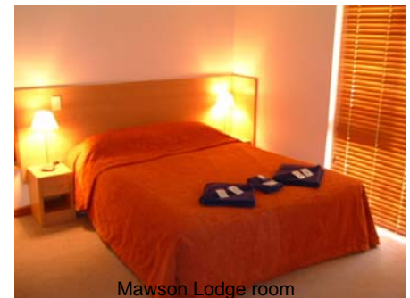
Mawson Lodge room