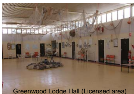
Greenwood Lodge Hall (Licensed area)

Why not consider Arkaroola for your next corporate convention, conference or wedding?